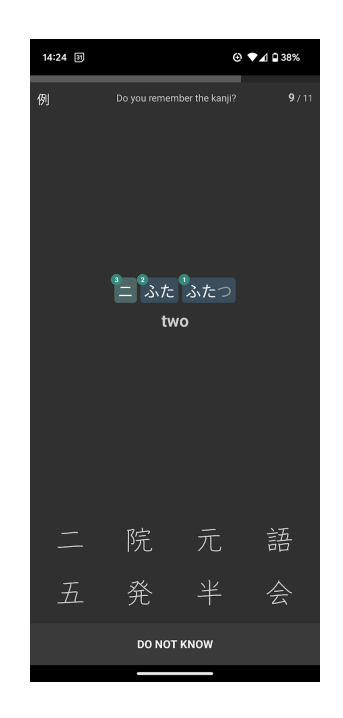
Figure 7 Guided Study

The "Guided Study" add-on adds a spaced repetition system to the application (see Figure 7). This system most closely resembles the quizzes as shown in Figure 7, incorporating readings, meanings, and form in various combinations to test the user on these aspects and associations. Spaced repetition systems (SRS) are an established method that have been studied extensively and implemented in a number of kanji learning and memorization applications. Kanji Study specifically cites the work of Piotr Woźniak as the system after which the algorithm is modeled, who in his paper established the foundations of spaced repetition that would later come to be SuperMemo (Woźniak and Gorzelaczyk, 1994). These methods employ algorithms that space out study content in a way that is thought to maximize memorization.