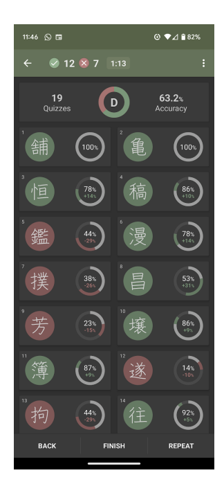
Figure 4 Post-Session Feedback

At the end of study sessions, feedback will be provided by the application, showing the rate of correct responses per kanji studied and allowing users to track their progress. As displayed in Figure 4, this feedback gives the overall accuracy rate for that session and individual kanji, as well as the overall change in success/failure rate since the previous session on the specific kanji tested.